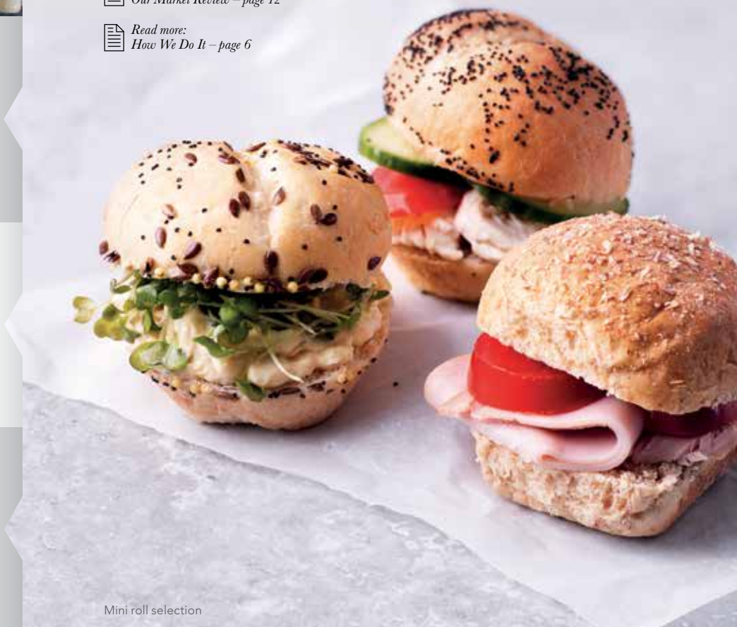
Mini roll selection