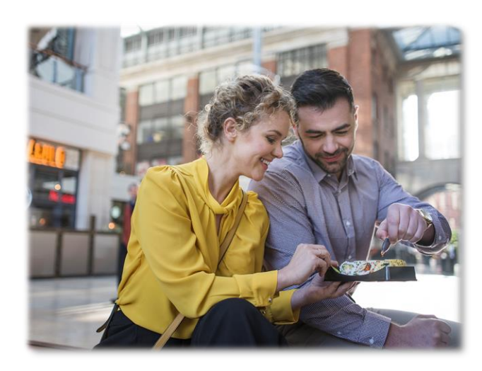
Proliferation of meal and snacking occasions