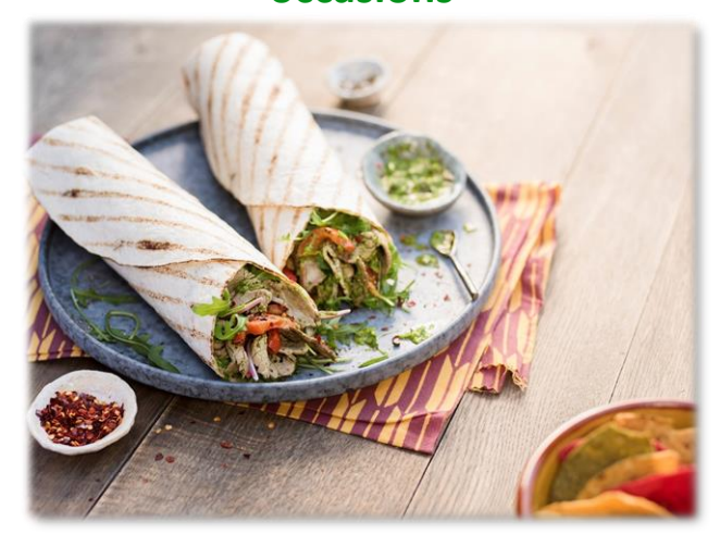
Fresher, healthier, 'local' product