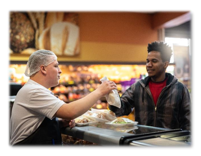
Food to go driving retailer growth and returns