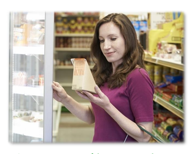
Consumers seeking convenience